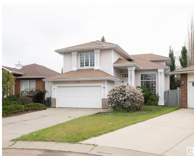
11511 12 Ave NW, Edmonton, AB