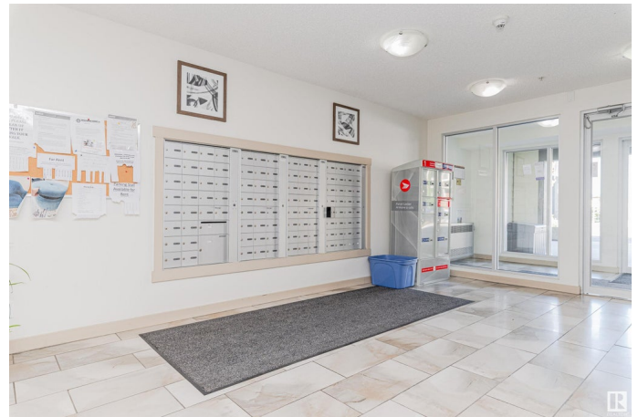
223-5816 Mullen Pl NW, Edmonton, AB